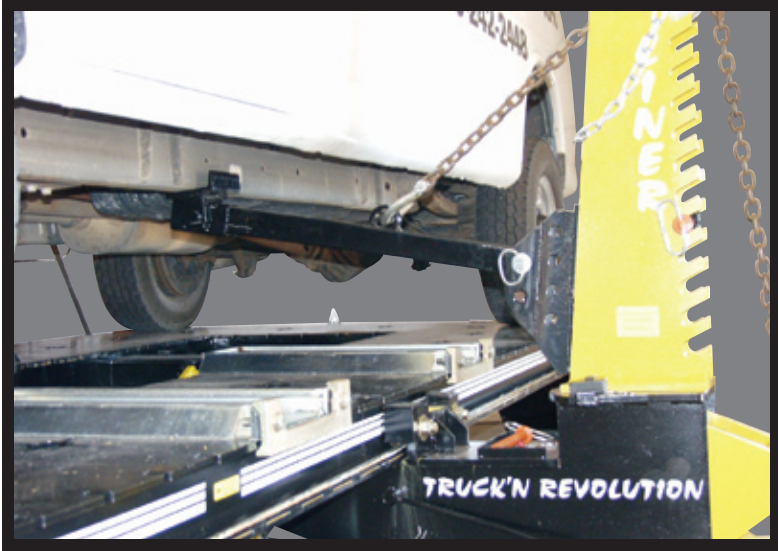
#656000, Tower Jack System, 64 lbs.